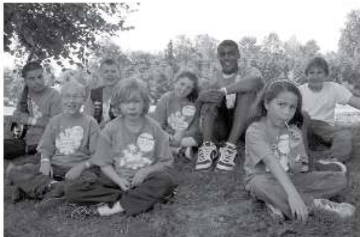
Our stars relax after last year's ride. You can make a difference to brain tumor survivors like them in Puget Sound by joining us at Remlinger Farms on Sept. 9!